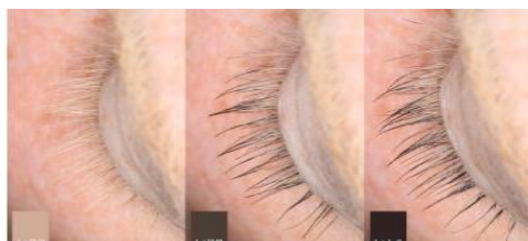
Baseline Carbon Black Dispersion Ink Black Chip AQ

Clinical test shows that a mascara formula with Distinctive® Ink Black Chip AQ showed higher color intensity than a formula with a standard carbon black aqueous dispersion.